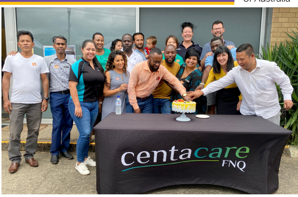
CALD Community Leaders along with Local Government Leaders, Centacare FNQ Staff celebrate Community Information Day

Funding: Queensland Health through the CALD COVID-19 Health Engagement Project (CCHEP) and Refugee Health Network QLD