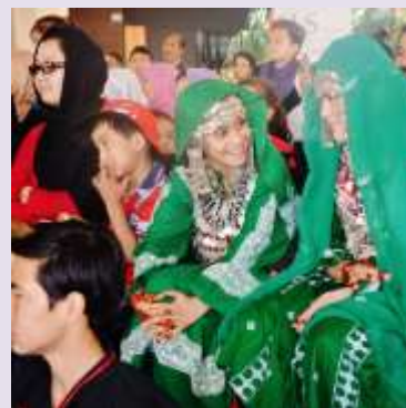
Nowruz Festival 2014