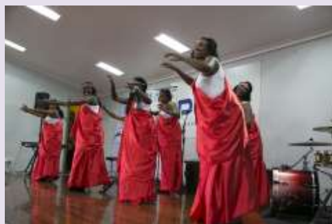
Iktumburwa Dance Group_Harmony Day 2014