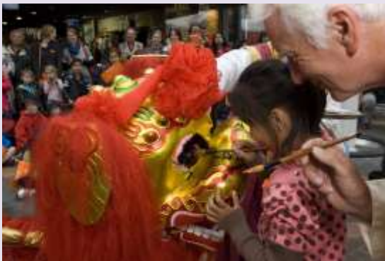
Harmony Day celebrations in Hobart

SCOA would like to share these photos from our member's Harmony Day 2014 Celebrations. Harmony Day is celebrated 21st March and is a day of cultural respect for everyone who calls Australia home.