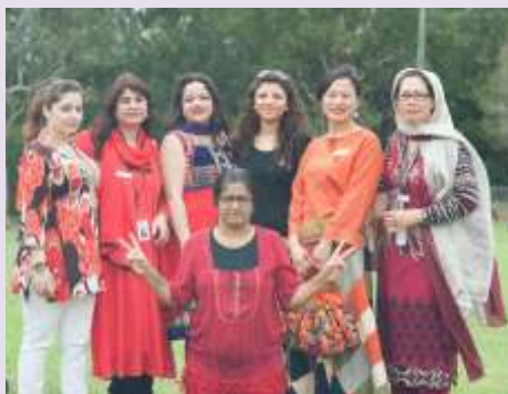
SSI staff and volunteers at Harmony Day celebrations