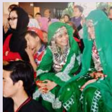
Nowruz Festival 2014