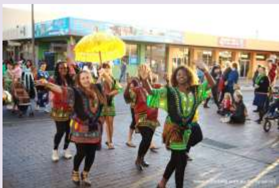
Alice Springs Desert Festival Sunset Street Parade

The MCSCA will be celebrating its "Big Day Out in Harmony" on 31st May 2014 at the Alice Springs Town Council Lawns. There will be performances from a wide variety of multicultural groups, an ethnic costume parade, food stalls, kids' activities and short films from the Colourfest Multicultural Film Festival.