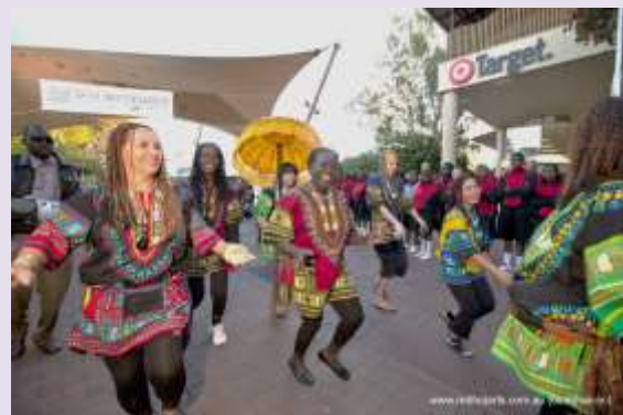
Alice Springs Desert Festival Sunset Street Parade

Article information and photos courtesy of Multicultural Community Services Central Australia