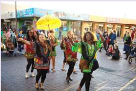
Alice Springs Desert Festival Sunset Street Parade

The MCSCA will be celebrating its "Big Day Out in Harmony" on 31st May 2014 at the Alice Springs Town Council Lawns. There will be performances from a wide variety of multicultural groups, an ethnic costume parade, food stalls, kids' activities and short films from the Colourfest Multicultural Film Festival.